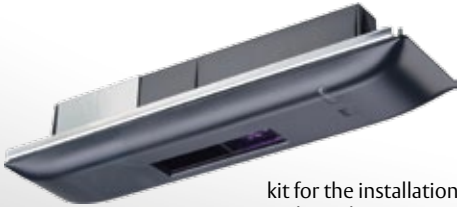
kit for the installation in the ceiling