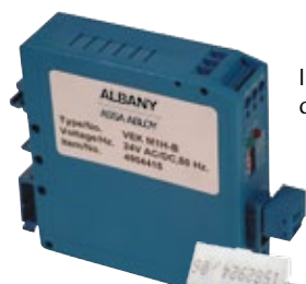
Induction loop detector

The switches can be surface-mounted or mounted semi-flush and are available with push-to-lock or touch function.