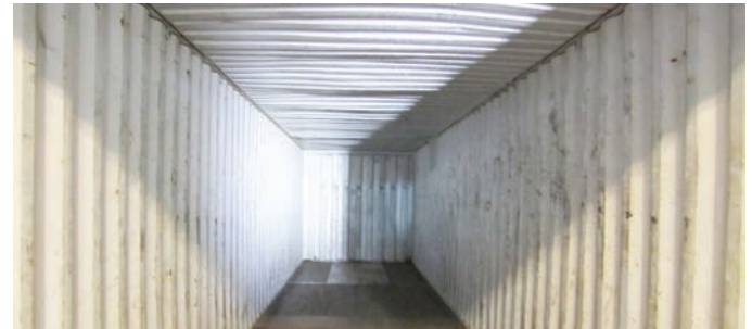
Inside of a truck lighten up by ASSA ABLOY M Dock Light