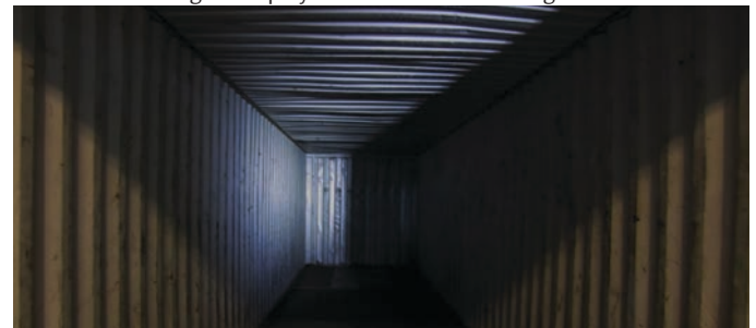
Inside of a truck without ASSA ABLOY M Dock Light