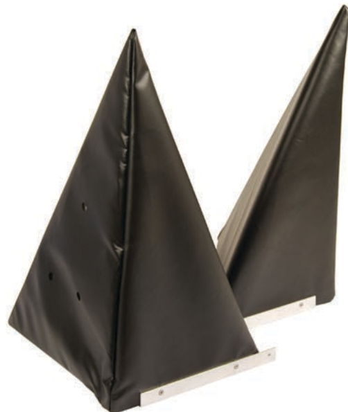
Corner seal ES (triangle)